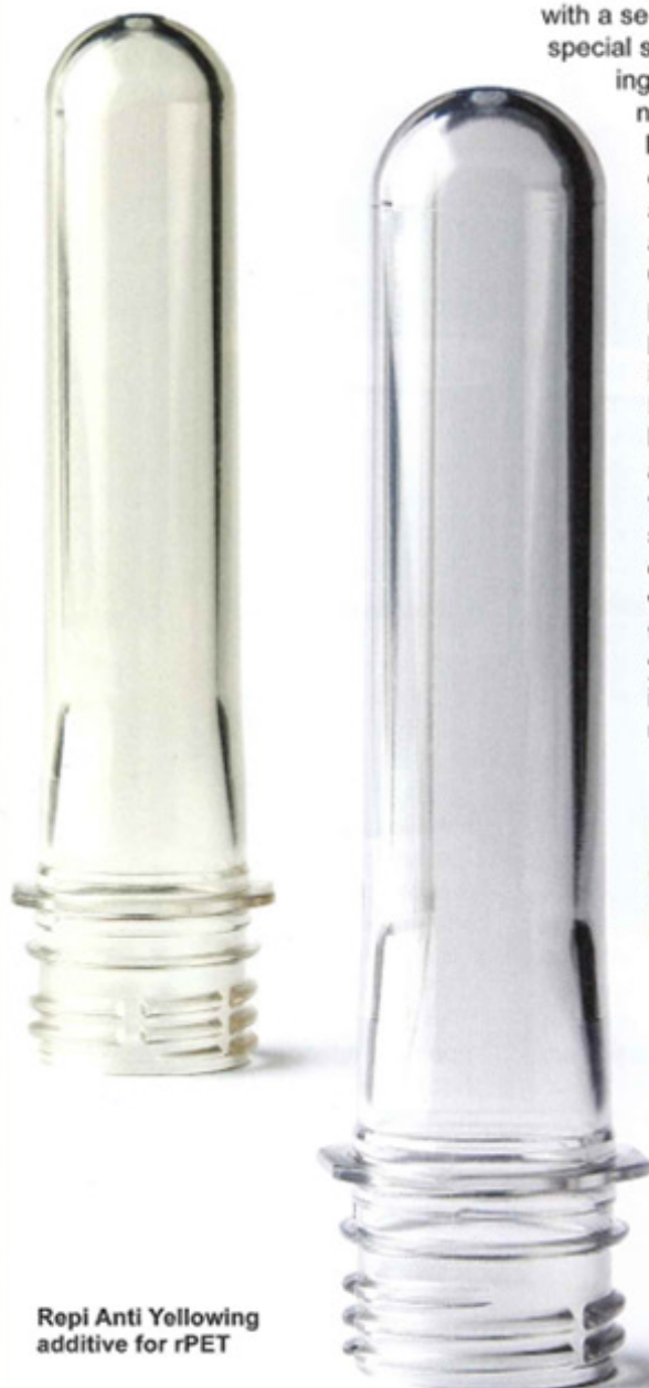
Repi Anti Yellowing additive for rPET

Repi Process Aid is another additive positively acting at the blowing stage by reducing sticking between one and other of preforms and bottles. This product creates a better slip effect between preforms and as a result up to +10% of preforms can be stored in a box, with consequent advantages in terms of transport and storage costs. Preforms maintain a better visual aspect, remain more transparent and clear, with fewer scratches. The recommended dosage is from 0.12% to 0.2%. Also here "all-in-one" solutions of colour and additive are often demanded by customers.